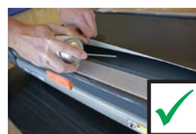
Spray evenly onto running deck