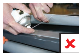
DO NOT Spray onto back of running mat